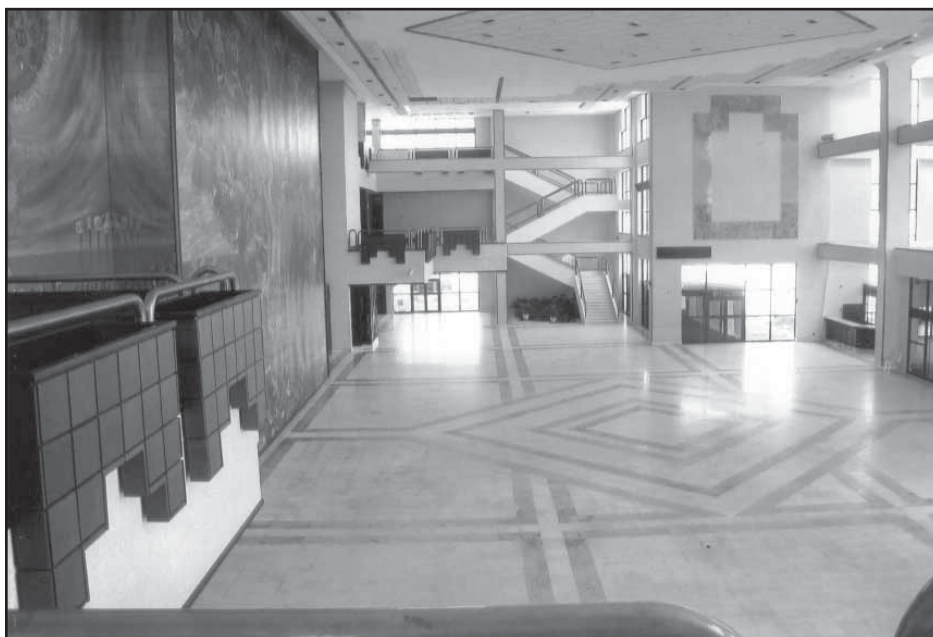
Lobby of the Accra International Conference Center