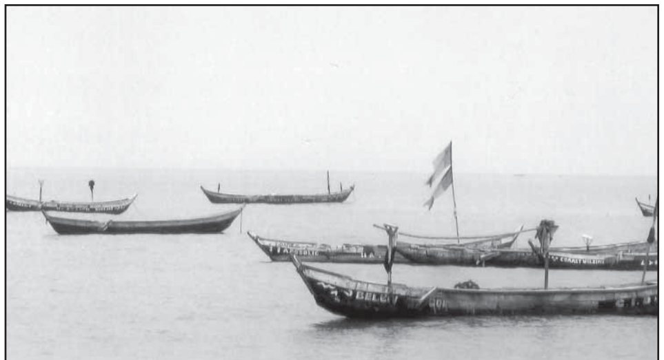
Fishing boats in James Town