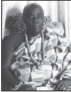
Osagyefuo Amoatia Ofori Panin II, Okyenhene

AKWAABA , you are welcome to meet the warm, friendly and hospitable people of Ghana. You will have the unique opportunity to have a glimpse and taste a bit of the Golden Experience: gold, cocoa (golden pod), wildlife, beaches, and the distinct craft work of a proud and colorful culture.